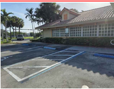
2100 West Atlantic Boulevard Pompano Beach, Florida

FOLIO: 4942-03-27-0012 SITE ADDRESS: 2100 West Atlantic Boulevard Pompano Beach, Florida